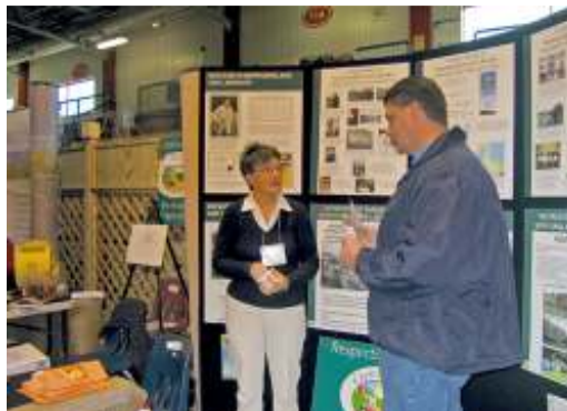
The Agricultural History Society at the Provincial Agricultural Show 2010.

We have developed an on-going Century Farm Award to honour those farm families who have farmed the same property continuously for one hundred years. This award is presented at industry events. Profiles of the Century Farms are added to our archives and exhibit material and also can be viewed at www.heritagefoundation.ca . Another long-term project is archival in nature. We encourage members of the agricultural community to donate documents which we in turn deposit in the Archives and Special Collections at Memorial University. In this way, we grow the profile of agriculture in the public collection: photographs, government reports, farm journals and records, agricultural research projects and publications.