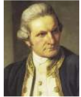
Captain James Cook

In 1762 St. John's was captured by French forces and in September of that year was recaptured by the English in the last battle of the Seven Years War. The Master of the flagship of the English fleet was James Cook who was already recognized by the Admiralty for his surveying and mapping skills. From 1762 to 1768 Cook would spend his summers charting the coast of Newfoundland and part of Labrador, producing charts that were so accurate that some were still in use well into the twentieth century. In September 2012 the Newfoundland Historical Society will hold a James Cook Symposium to mark the two hundred and fiftieth anniversary of Cook's first landing in St. John's. Expect further details on our website and in the Spring 2012 Newsletter.