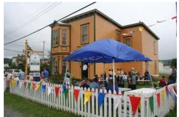
Tea party at the O'Reilly House