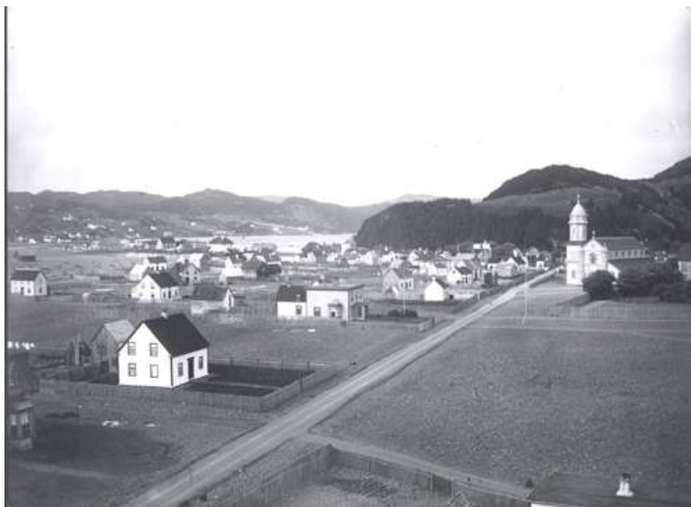
View of Placentia showing Mount Pleasant, pre-1901. Photographer: Holloway. Centre for Newfoundland Studies, M.U.N., Geography Collection, ref. 8.01.001.