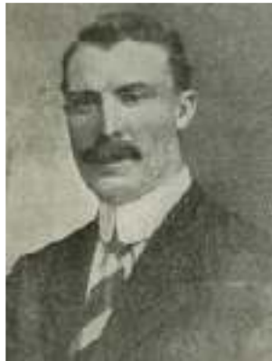
Captain Robert A. Bartlett (from the Newfoundland Quarterly , vol IX, no. 4, March 1910)