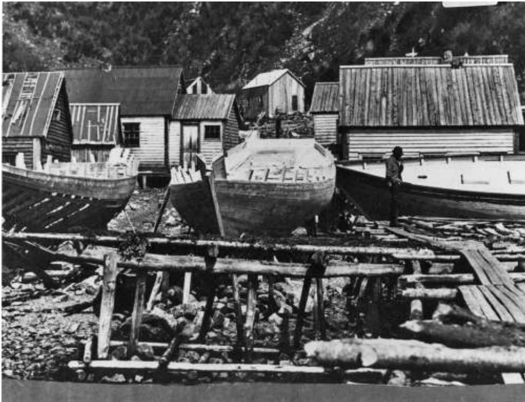
Centre for Newfoundland Studies Archives Coll. 137 (The Geography Collection), image 21.03 – Boatbuilding at Grey River, c. 1900