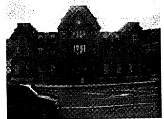
The Railway Coastal Museum on Water Street in St. John's was one of the winners in the 2004 Southcott Awards Competition

More information and nomination forms are available online at www.historictrust.com/southcott or by calling (709) 739-7870. The deadline is April 15, 2005.