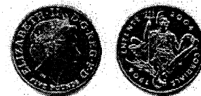
U.K. coin commemorating 100 years of Entente Cordiale

In September we began with a symposium on the Entente Cordiale.