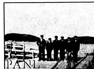
Boys on the wharf in St. Anthony.