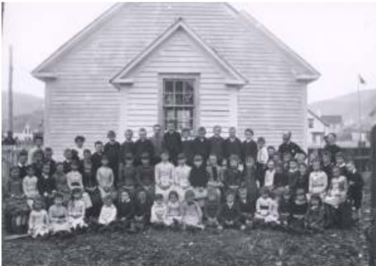
Group of children in front of a school, date and location unknown.