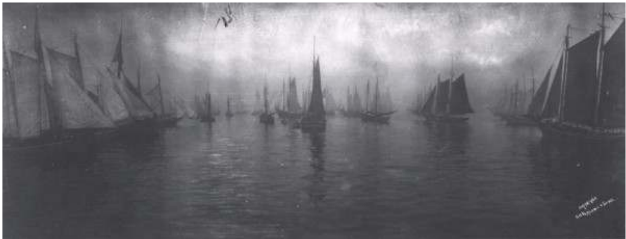
“Waiting for the fog to lift”; schooners in full sail, pre-1908. Memorial University Library, Geography Collection. COLL-137; HPNL0926.

Exhibit: Duration: September 15th. – Ongoing Location: Provincial Archives Division Reference Room